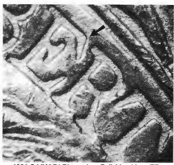
1881 O VAM 74 Die marker- Polishing Lines ER