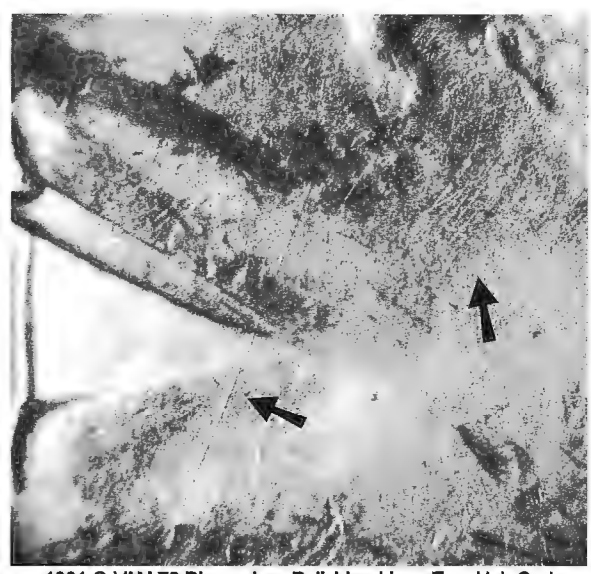
1881 O VAM 76 Die marker- Polishing Lines Eye, Hair Curl