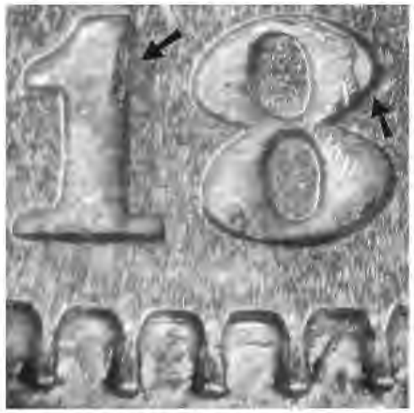
1881 O VAM 76 Doubled 18