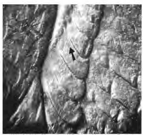
1881 O VAM 4 Die marker- X Polishing Lines Inner Feathers