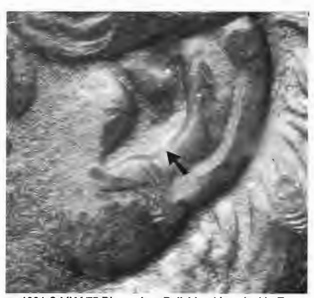
1881 O VAM 75 Die marker- Polishing Lines Inside Ear