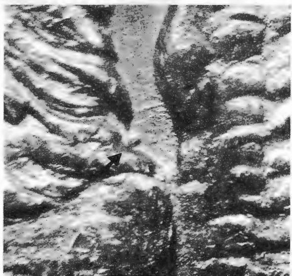
1881 O VAM 74 Die marker- Polishing Lines Wing-Neck Gap