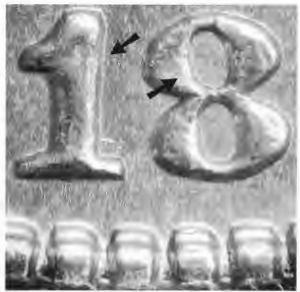
1881 O VAM 74 Doubled 18